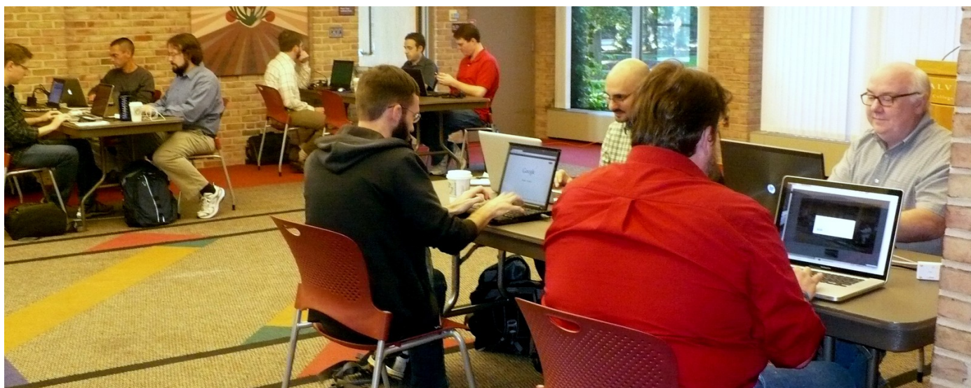
Hack-a-way at the Evergreen Conference.

The Selenium project, maintainers of a FLOSS automated browser testing software suite, hosted Selenium Conference 2013 in Boston, Massachusetts on June 10-12, 2013. SeConf '13 was Selenium's largest conference yet, attracting over 500 attendees from all over the world to network, attend workshops, and learn more about the project.