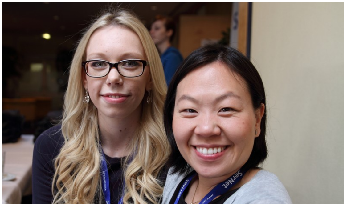
Top L: Cake for Samba 4. Top R: SambaXP attendees. Bottom: Additional SambaXP attendees. All photos © 2013 SerNet. Used under a CC By-SA 4.0 license.

Wine is a FLOSS implementation of Windows programming interfaces, allowing Windows software to run on other platforms such as GNU/Linux and Mac OS. In July 2013, after sixteen months of development, Wine released version 1.6, which included a large number of changes including better Mono (.NET) support, better support for Mac OS, and significantly improved support for new apps and games.