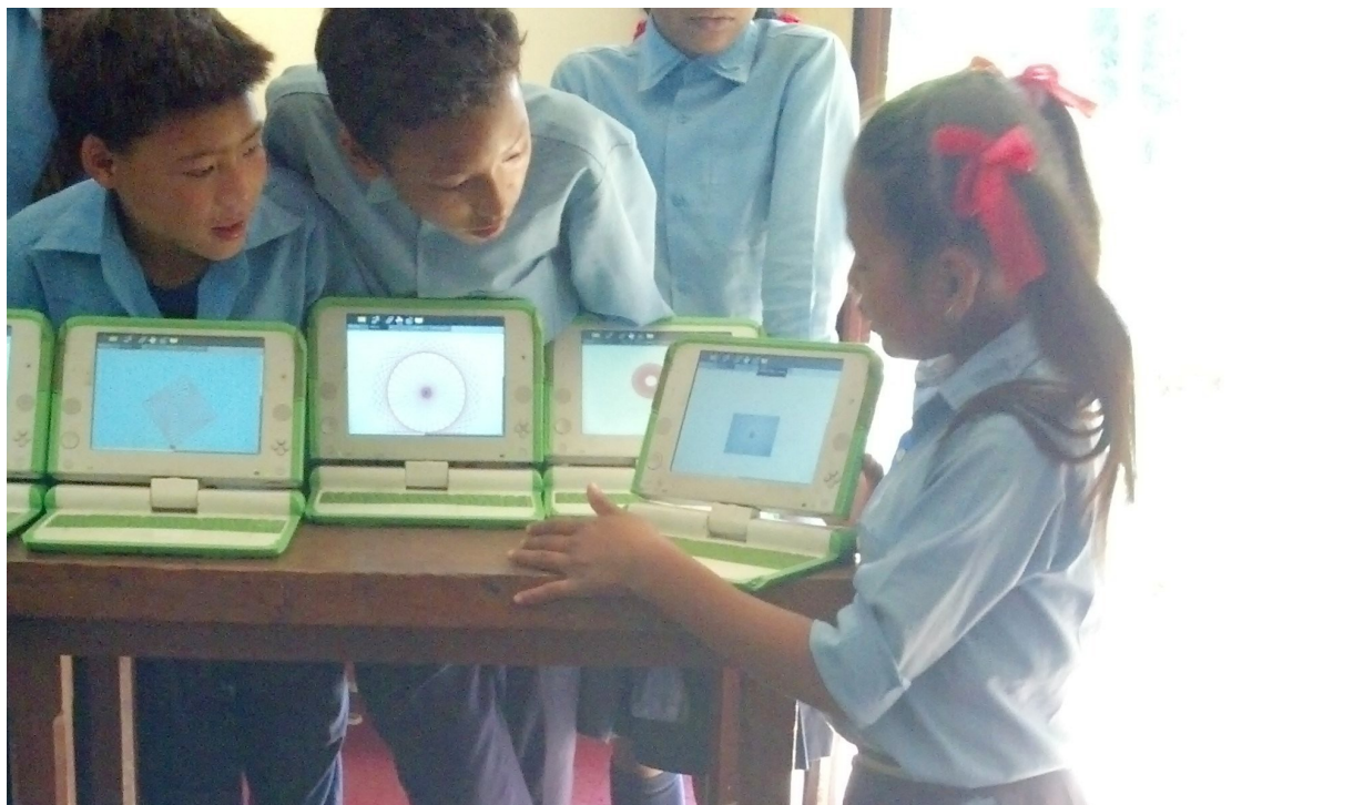
Children Programming using Sugar Labs. © 2013 Walter Bender. Used under a CC By-SA 4.0 license.

In FY2013, Sugar Labs made strides in making JavaScript/HTML5 a first class programming environment while continuing to work closely with the Fedora and GNOME upstream communities. Over 30% of the patches in their newest release come directly from Sugar users: the children themselves.