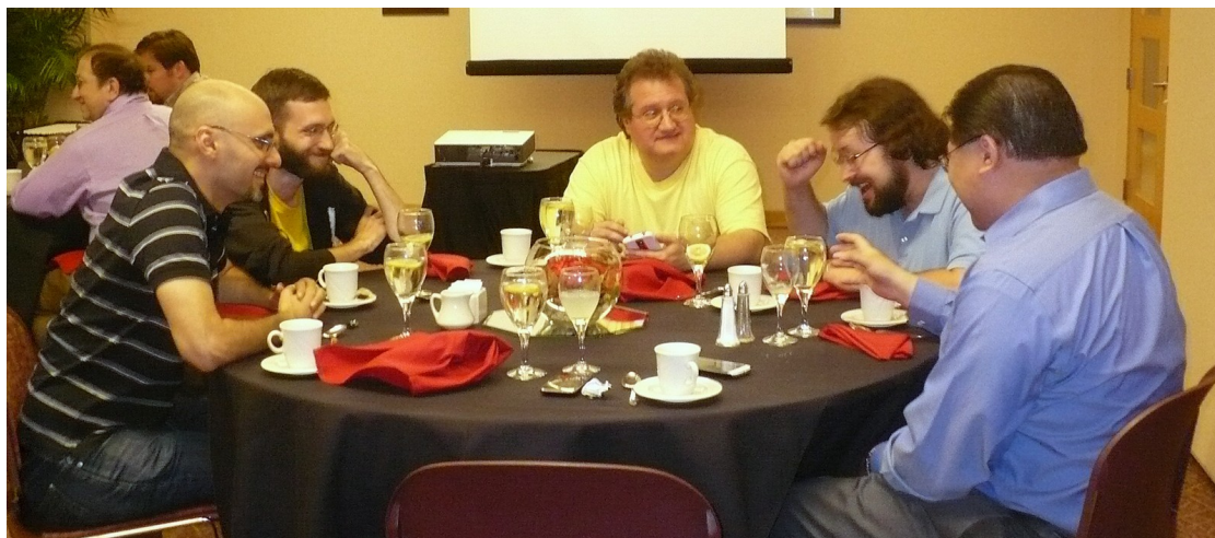
Evergreen Hack-a-way dinner, sponsored by Equinox Software. © 2013 Software Freedom Conservancy, available under a CC By-SA 4.0 license.

phpMyAdmin is a FLOSS web interface to several popular database systems including MySQL, MariaDB and Drizzle. In FY2013, Conservancy welcomed phpMyAdmin to its list of sponsored projects. phpMyAdmin also released a new version of their software which included a significant improvement to their web interface.