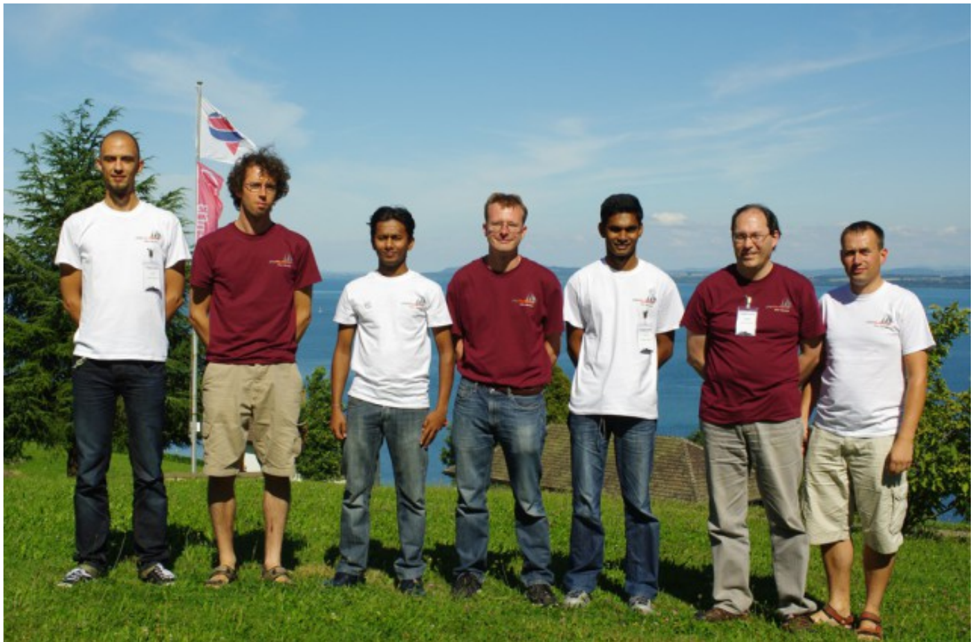
phpMyAdmin developers @ DebConf '13.

OpenTripPlanner is a FLOSS platform for transportation routing. OTP can provide itineraries for travel within a municipality via combinations of driving, cycling, walking, and public transit segments. It can even do large scale network analysis and prediction modeling, allowing for simulations which can be used for design or emergency preparedness. Learn more about OpenTripPlanner at http://opentripplanner.org .