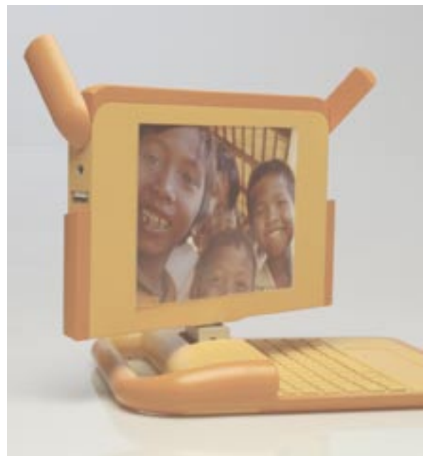
PHOTO The children's laptop from One Laptop per Child—a potent learning tool created expressly for the world's poorest children living in its most remote environments.

The list of founding members includes several members of the GNOME Foundation advisory board—ACCESS, Imendio, Nokia, OLPC and OpenedHand. Of the other companies involved, several are small companies started from within the GNOME project such as Waugh Partners, Openismus, Collabora and Fluendo. Alongside these, industry heavyweights and free software projects are actively participating.