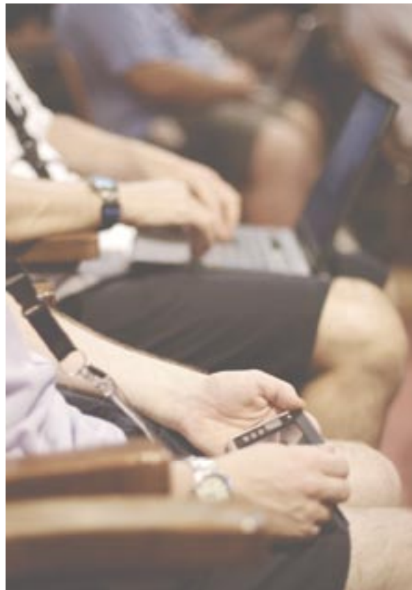
PHOTO GUADEC—The GNOME Conference—was held in the scenic seaside town of Villanova i la Geltru, near Barcelona. A row of conference participants working digitally.

The GNOME Foundation would like to congratulate all the distributions for their hard work during this year, and would like to thank everyone for their continued support of the project.