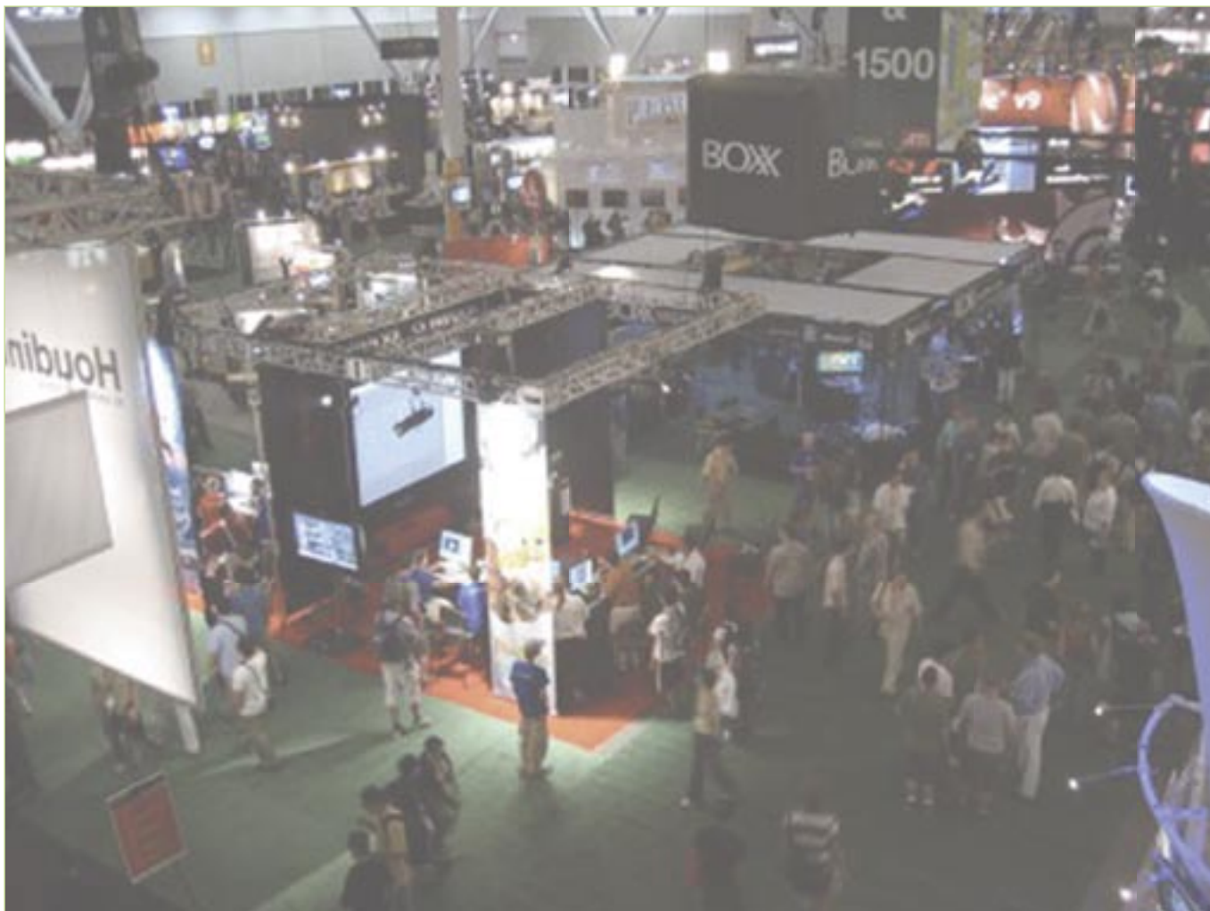
PHOTO SIGGRAPH 2006—The 33 rd International Conference and Exhibition on Computer Graphics and Interactive Techniques, Boston, Massachusetts. A view of the open-source pavilion from above.

is focussed on the use of GNOME technology in mobile and embedded computing environments (see article).