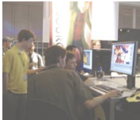
PHOTO SIGGRAPH 2006. The graphics community has some of the highest standards for software, and open-source is fulfilling them.

New versions of several pieces of the GNOME Platform were released in July including GLib 2.12, GTK+ 2.10 and Cairo 1.2. July also saw the attempted migration of the GNOME project from the CVS revision control system to the much newer Subversion. Unfortunately things did not go to plan and the migration had to be aborted. Not giving up hope, the project hopes to be using Subversion for revision control by 2007. Christian Perrier of the Debian project was invited