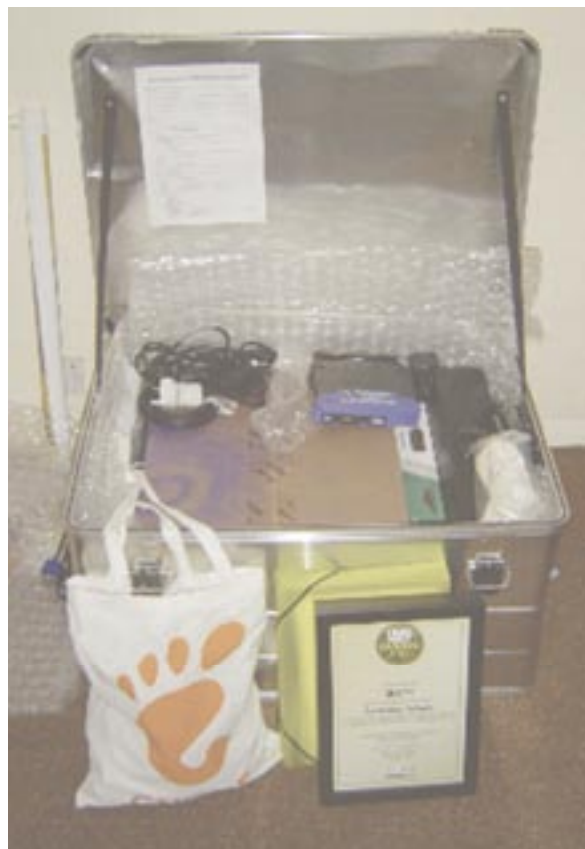
PHOTO The European event box unpacked.

Next year, we hope to expand the activities of various user groups by providing the means to have more local gatherings of GNOME users, and by encouraging participation of user groups in regional conferences.